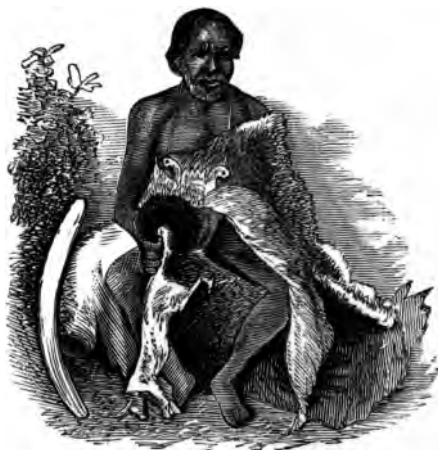
NATIVE AUSTRALIAN ON THE MARCH.

wood, and in a very cruel manner would break all their legs, and leave them thus under the scorching sun ; but soon on their track would follow the squatter, with stock rider and men, not omitting to take with them a native guide, who, like a bloodhound, is exceeding clever in discovering the haunts of the natives, many of whom, when found, paid in the struggle the penalty of death.